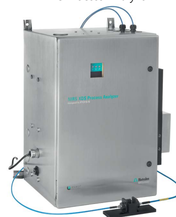
NIR XDS Process Analyzer